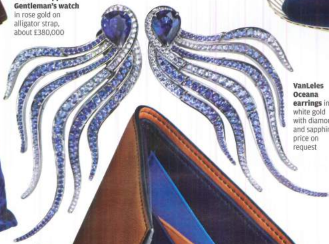
VanLeles Oceana earrings in white gold with diamonds and sapphires, price on request