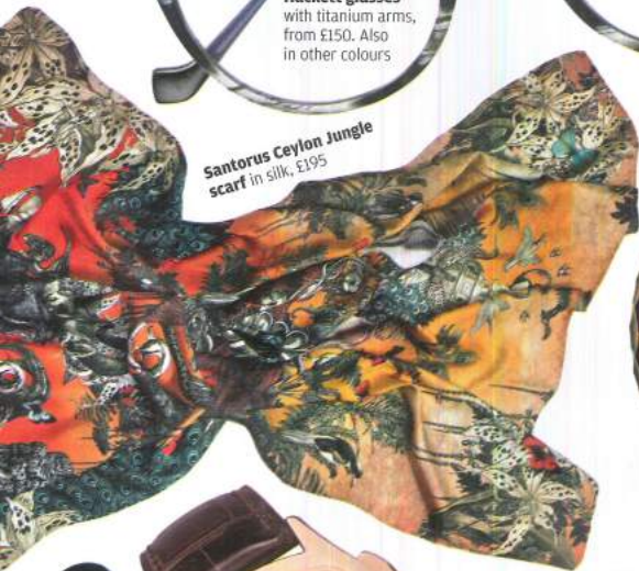
Santorus Ceylon Jungle scarf in silk, £195