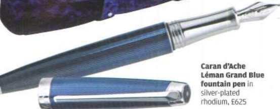
Caran d'Ache Léman Grand Blue fountain pen in silver-plated rhodium, £625