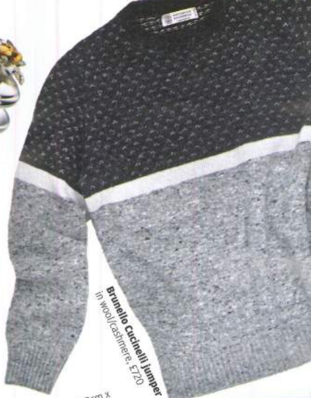
Brunello Cucinelli jumper in wool/cashmere, £720