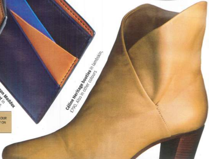
Celine Heritage boots in lambskin, £790. Also in other colours

STOCKISTS BRUNELLO CUCINELLI, 159 SLOANE STREET, LONDON SW1 (020-7730 5207; WWW.BRUNELLOCUCINELLI.COM); CARAN D'ACHE, WWW.CARANDACHE.COM; CELINE, 103 MOUNT STREET, LONDON W1 (020-7491 8200; WWW.CELINE.COM); HACKETT, 193-197 REGENT STREET, LONDON W1 (020-7494 4912; WWW.HACKETT.COM); JEROME DREYFUSS, 22 BERNLEY SQUARE, LONDON W1 (020-7629 8800; WWW.JEROME-DREYFUSS.COM); KNOLL, 91 GOSWELL ROAD, LONDON EC1 (020-7236 6655; WWW.KNOLL.COM); PATEK PHILIPPE, 16 NEW BOND STREET, LONDON W1 (020-7493 8866; WWW.PATEK.COM); SANTORUS, WWW.SANTORUS.COM; SMYTHSON, 40 NEW BOND STREET, LONDON W1 (020-7629 8558; WWW.SMYTHSON.COM); THEO FENNEL, 169 FULHAM ROAD, LONDON SW3 (020-7591 3000; WWW.THEOFENNEL.COM); VANLELES, 174 NEW BOND STREET, LONDON W1 (020-7409 1081; WWW.VANLELES.COM).