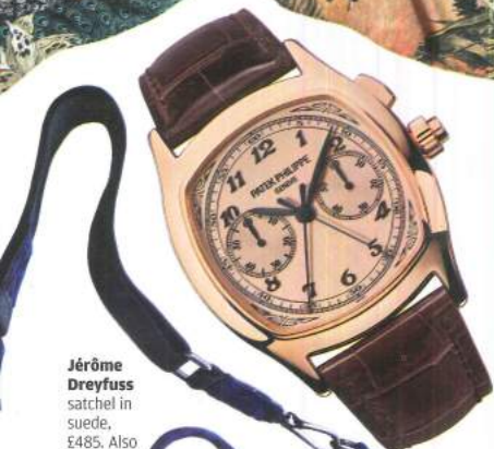
Patek Philippe Gentleman's watch in rose gold on alligator strap, about £380,000