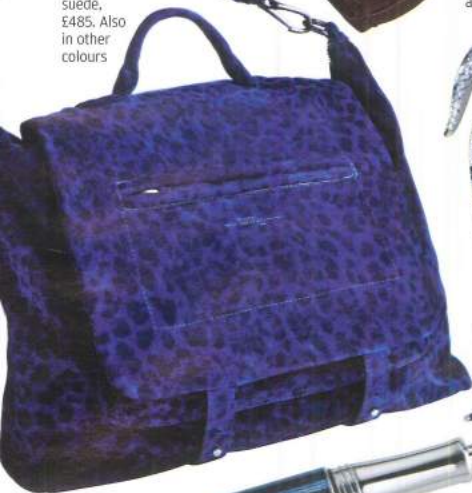
Jérôme Dreyfuss satchel in suede, £485. Also in other colours