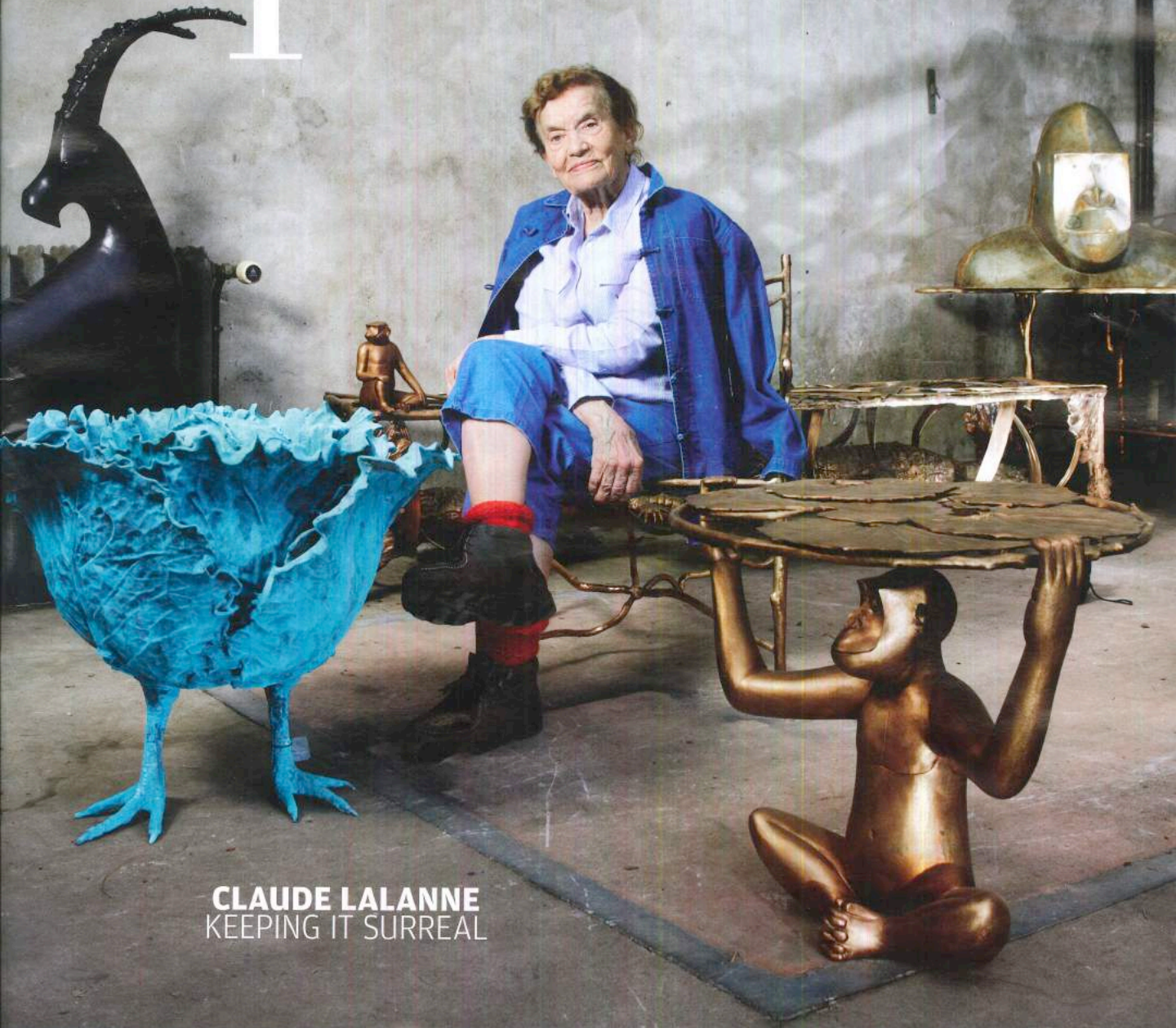
CLAUDE LALANNE KEEPING IT SURREAL