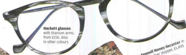
Hackett glasses with titanium arms, from £150. Also in other colours