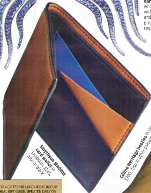
Smythson Maddox card wallet in lambskin, £245. Also in black