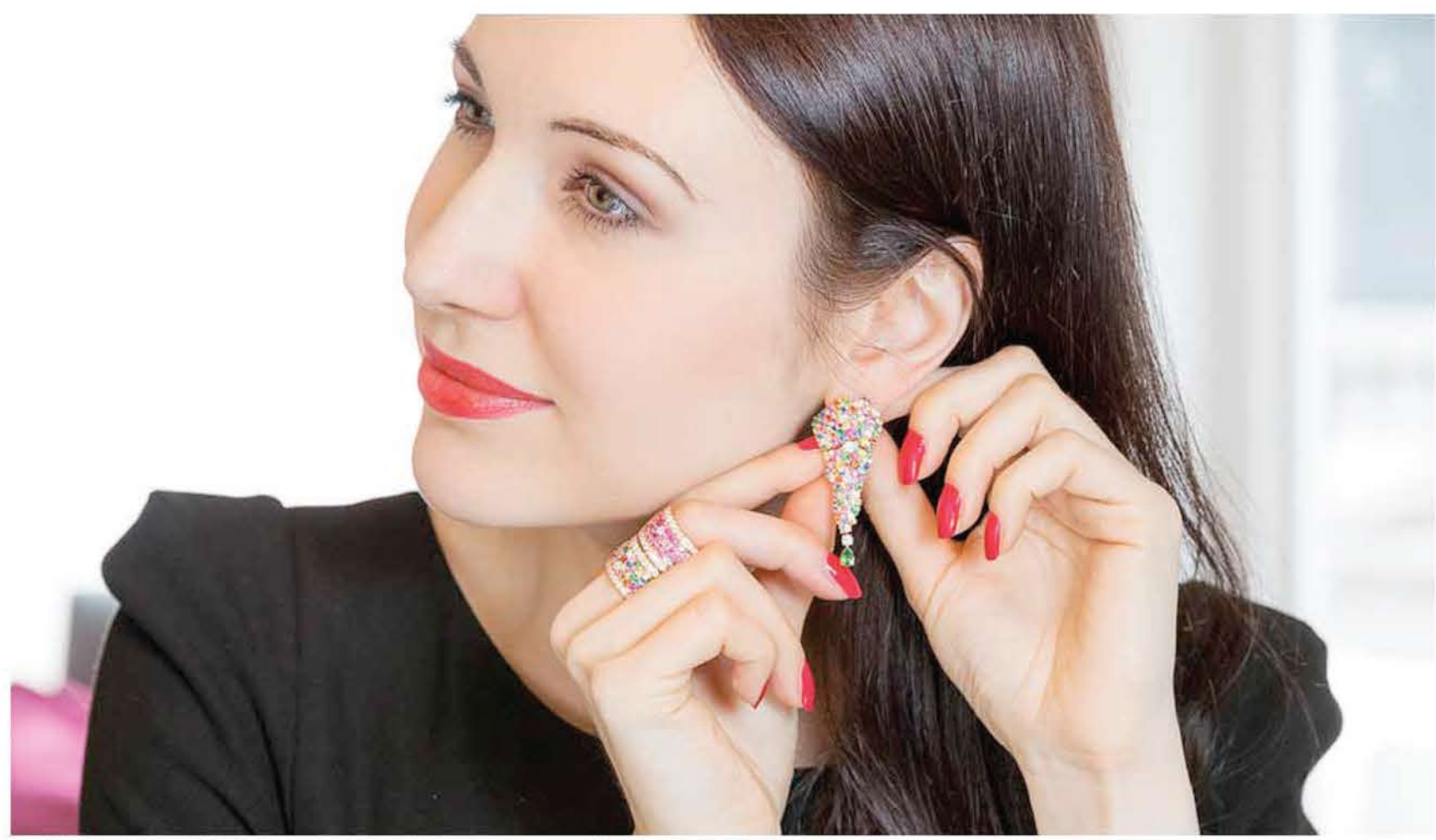
Vanleles Legends of Africa earrings and rings in diamonds and multicoloured sapphires

K.P.: Is the Legends of Africa Collection a tribute to your home country?