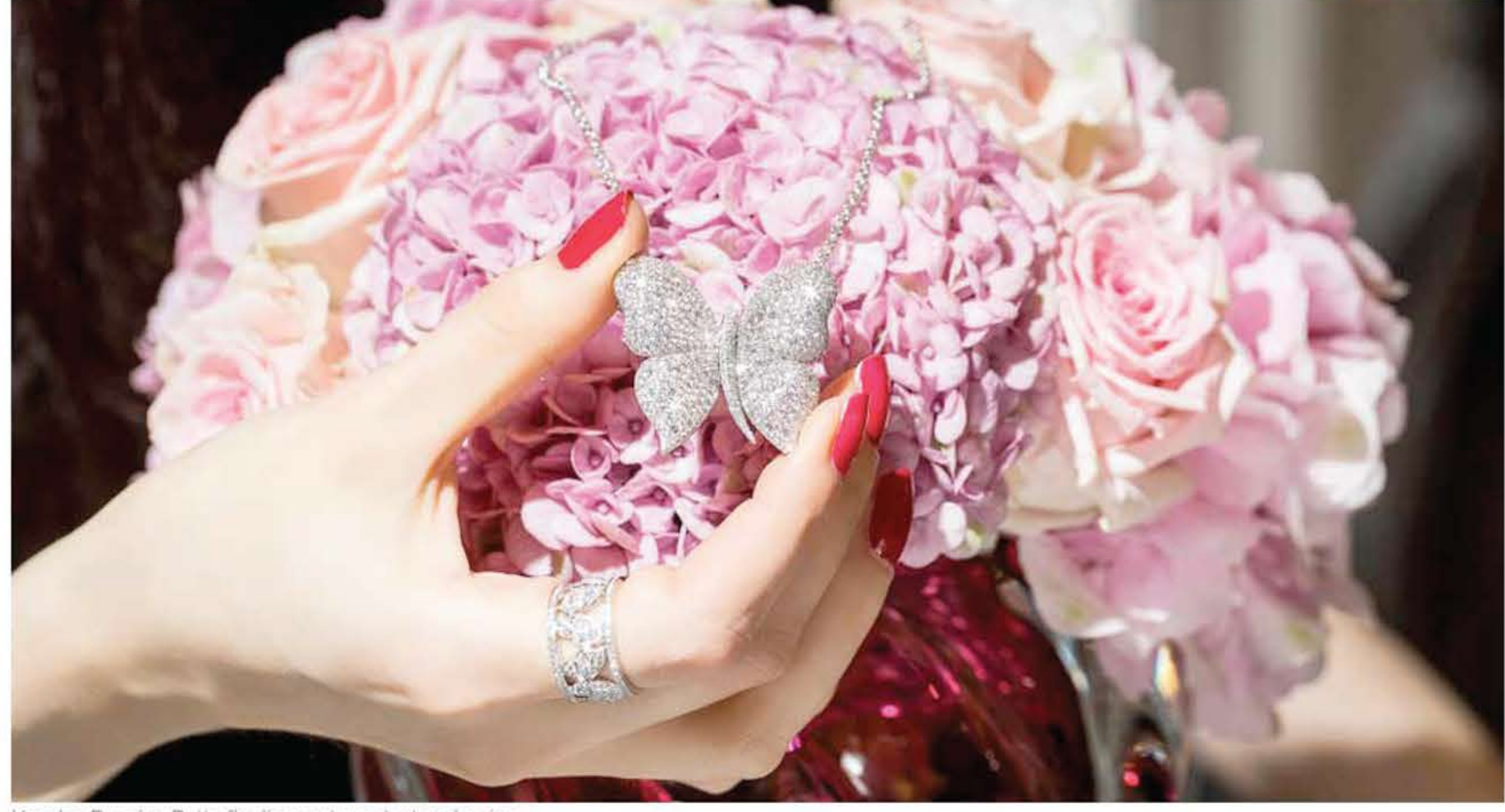
Vanleles Dancing Butterfly diamond pendant and a ring