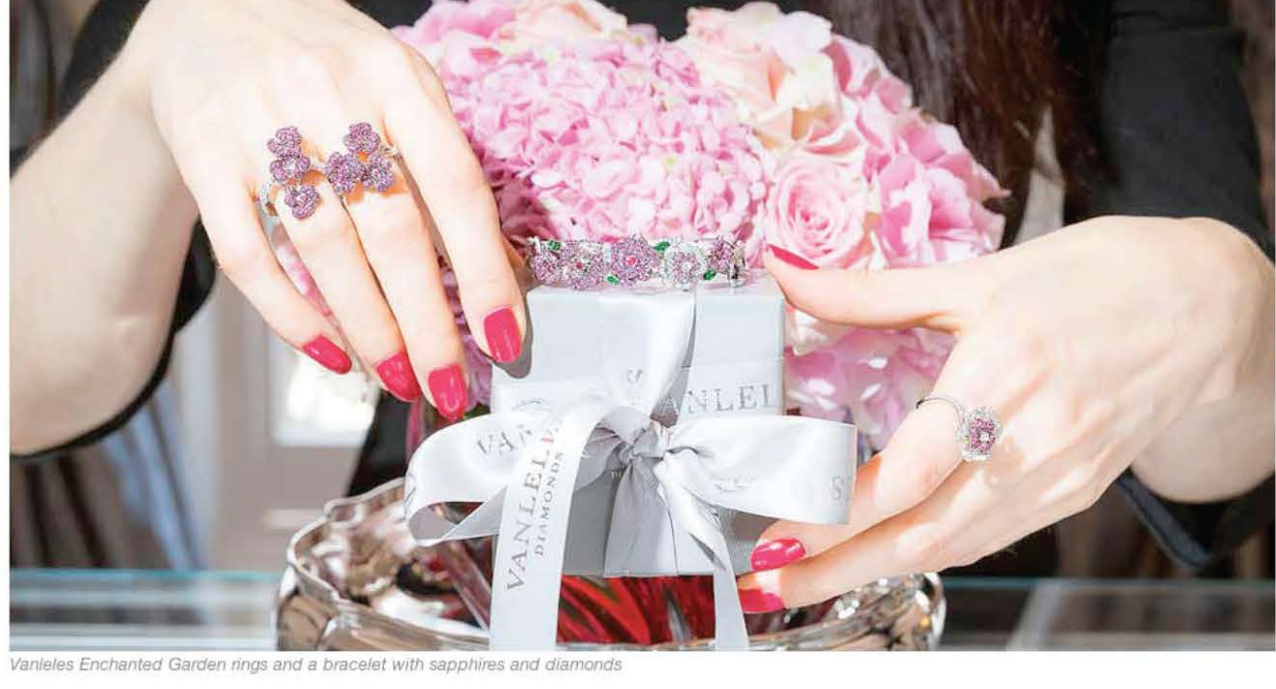
Vanleles Enchanted Garden rings and a bracelet with sapphires and diamonds